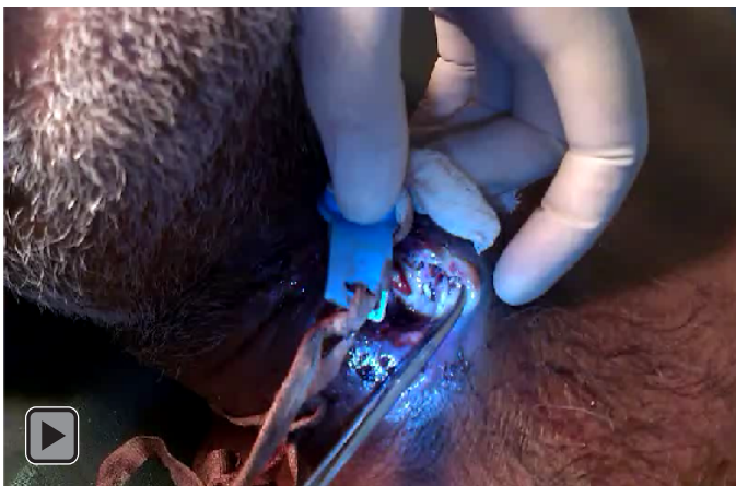
Figure 2: On the day of discharge – healthy wound site.